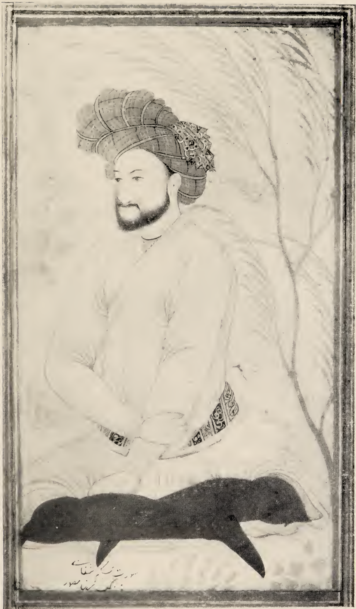
SHIFÁ'Í, POET AND PHYSICIAN